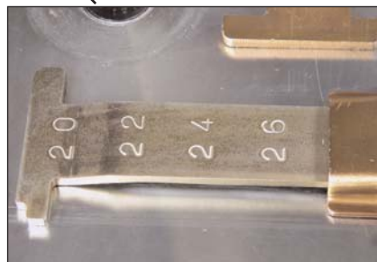
Non-opposing adjustable jaws with embossed dimensions for easy, fast and accurate clamping.