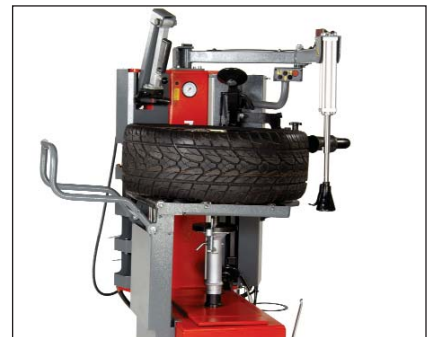
Integrated wheel lift with rollers provides extra assistance to technician.