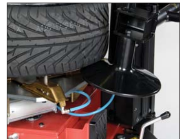
Locking roller disc lifts and removes bottom bead effortlessly and securely.