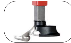
SM102725 Plastic protection for back side of mount/demount heads.