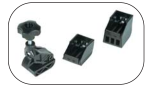
SM103302 Bead depressor tool, adjustable plastic clamp style.