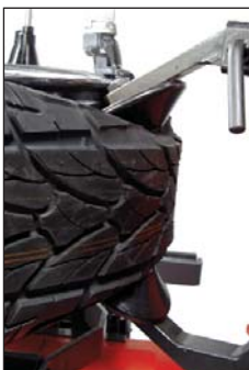
Dual clamping rollers make tire to rim matching fast and effortless.