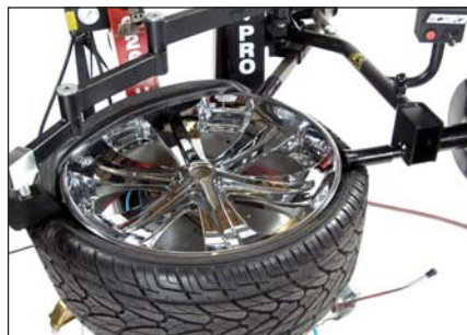
Accu-Pro Mounting Helper shown easily mounting the top bead on 26" rim.

Hands-Free - Mount the most difficult high-performance low-profile tires with ease. Changing low-profile, run-flats and PAX tires only requires one technician.