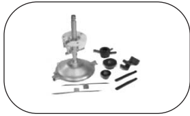
SM102666 PAX Tire Kit for use with Accu-Pro Mounting Helper (includes roller, rim protectors, bead levers, and center post adaptors).