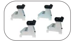
SM102724 Set of four motorcycle clamp adaptors for use on models 220A and 320S. Use SM103284 for models 326S/SFA, 526T/THP, and 626THP.