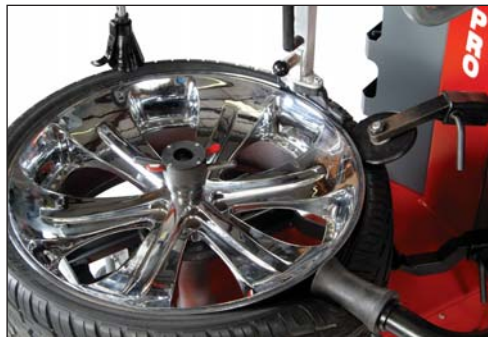
Three-point bead depression system easily mounts difficult top tire beads.