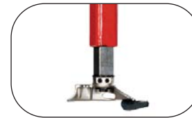
SM101608 Mount/demount head protective plastic inserts (pack of 5).