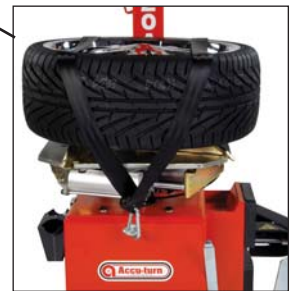
Safety Inflation System secures rim during inflation to prevent operator injury and decrease shop liability.