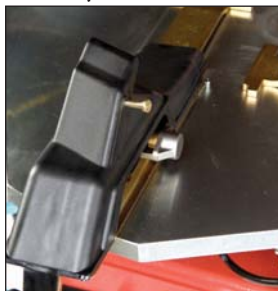
Optional jaw protector covers, part #SM103394 lock into place for extra safety. Protector covers prevent accidental rim damage.