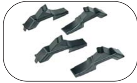
SM101402 Plastic clamping jaw protectors for models 220A and 320S. Use SM103394 for models 326S/SFA, 526T/THP, and 626THP.