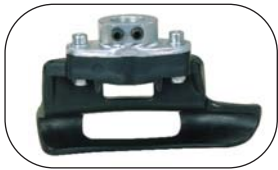
SM102529 Plastic duck head kit (requires 102765 adaptor for all models except 220A).