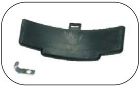
SM102090 Bead breaker plastic protection kit (includes SM101800 and SM102088).