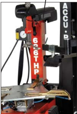
Unique telescoping tower allows for wide rims and produces added strength.