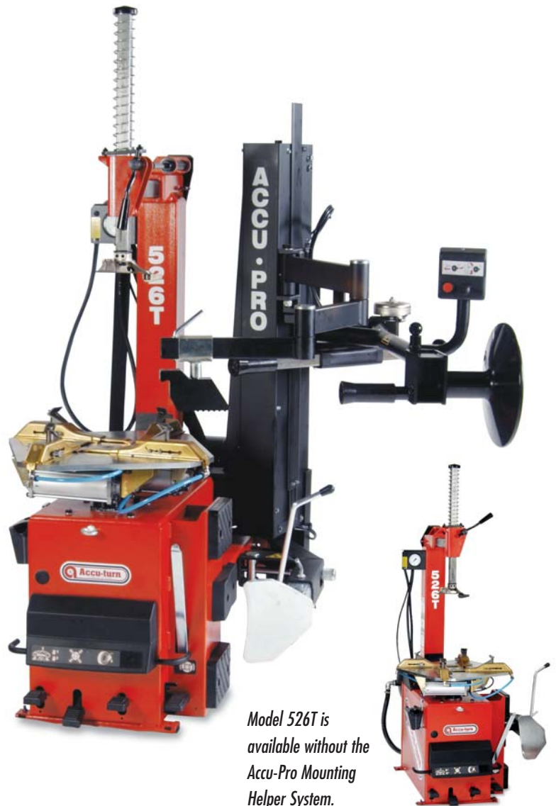
Model 526T is available without the Accu-Pro Mounting Helper System.