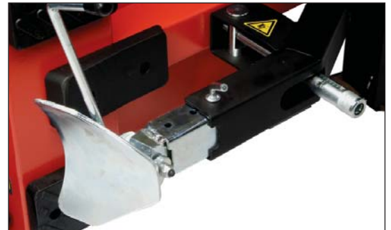
Adjustable 3-position bead-breaker to accommodate large wheel diameters with a telescopic adjustment to increase width capability.