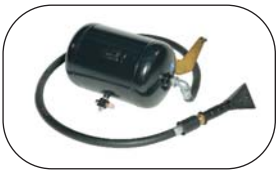
SM102711 Inflation system kit.