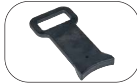
SM103261 Zeppa bead depressor tool for standard drop center rims. Use SM103216 Zeppa bead depressor tool for deep drop center rims (more than 2").